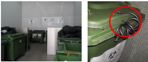
FMB pickup point

Some modification to make more safe and secure